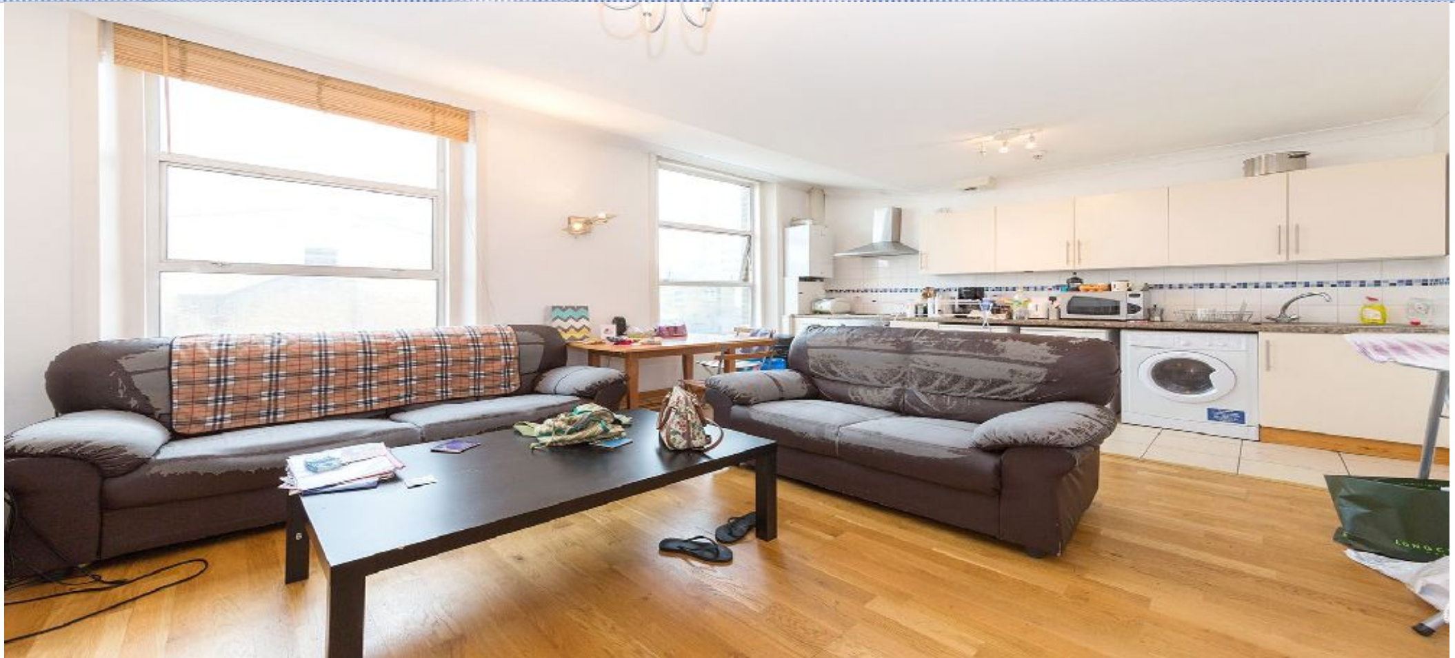
3 Bedroom Flat Rent In QUEENS PARK £ 525pw (£2275 pcm)