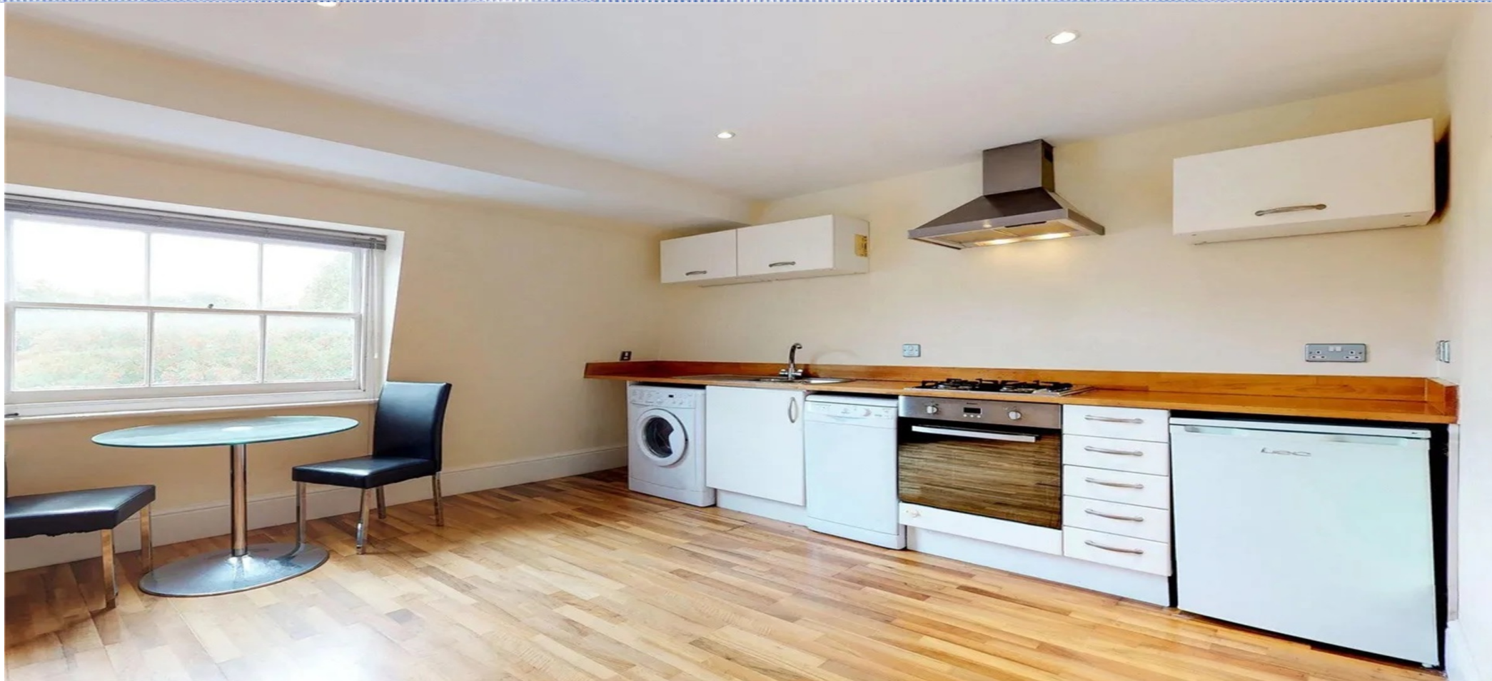
1 Bedroom Apartment To Rent In Hackney / Victoria Park £460pw (£1993 pcm)