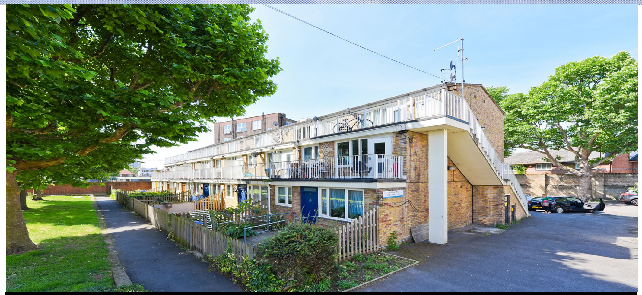
1 Bedroom Apartment To Rent In Tower Bridge/ Bermondsey... £370 p.w.(Includes Heating and Hot Water). (£1604 pcm)