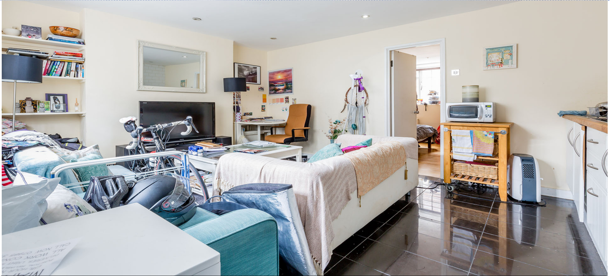
1 Bedroom Flat To Rent In Angel £420pw (£1820 pcm)