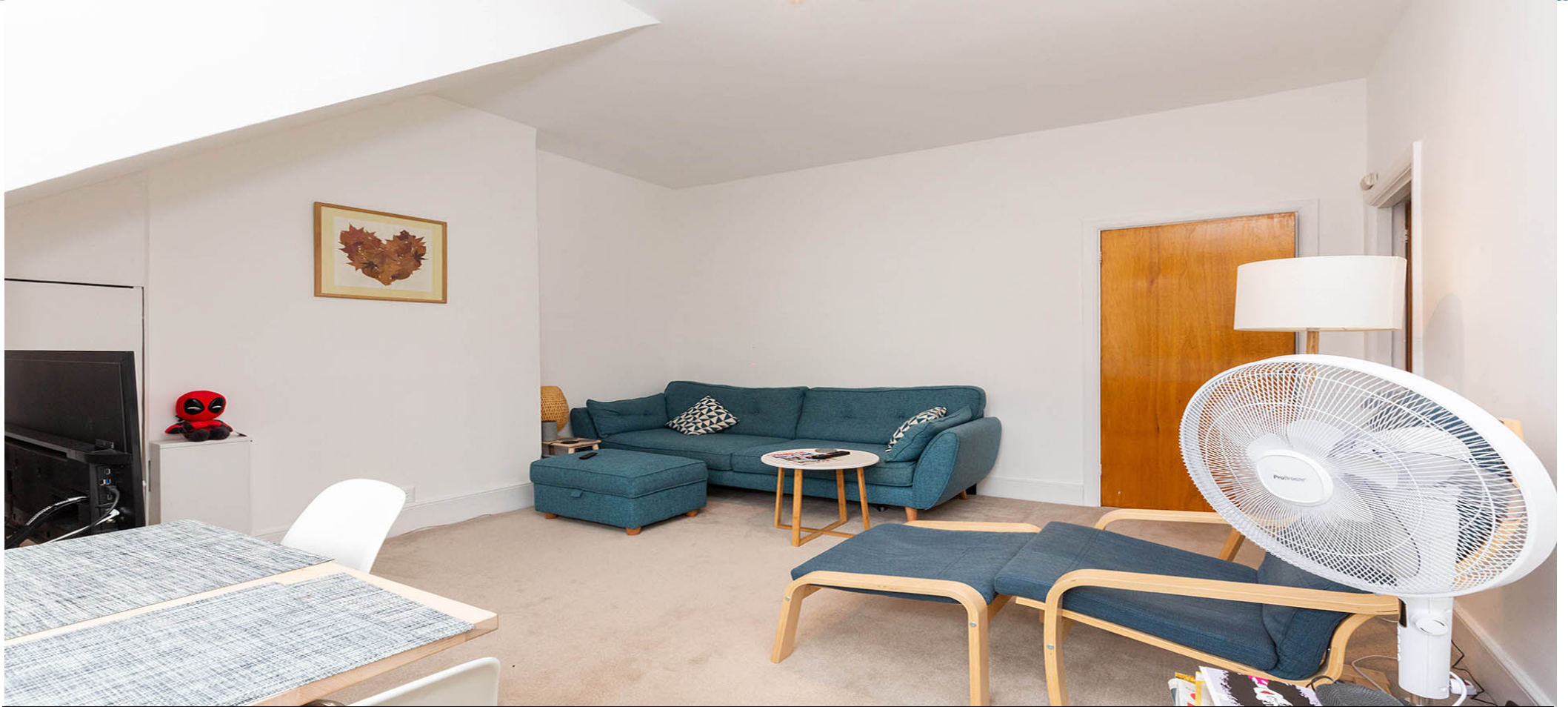
1 Bedroom Flat To Rent In Crouch End £350pw (£1516 pcm)