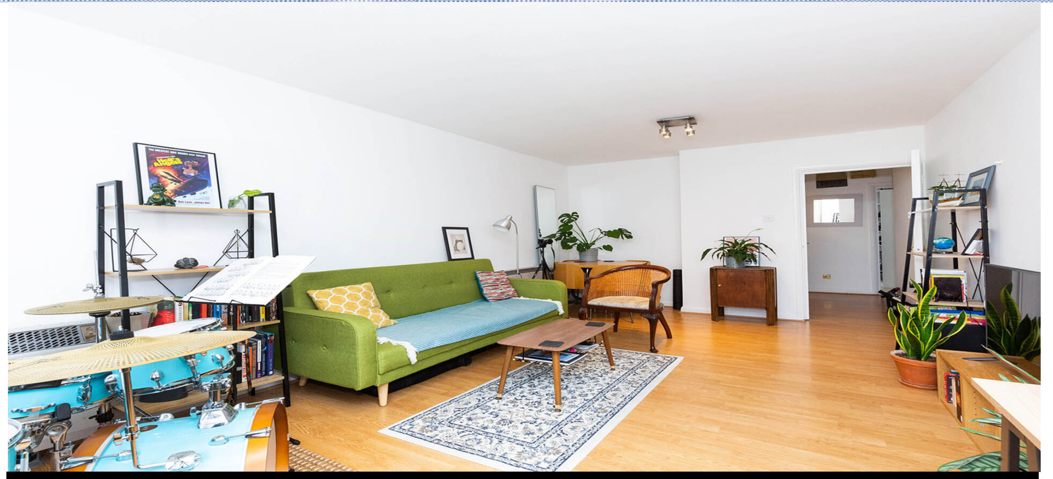
1 Bedroom Flat Rent In Haggerston£ 365pw (£1581 pcm)