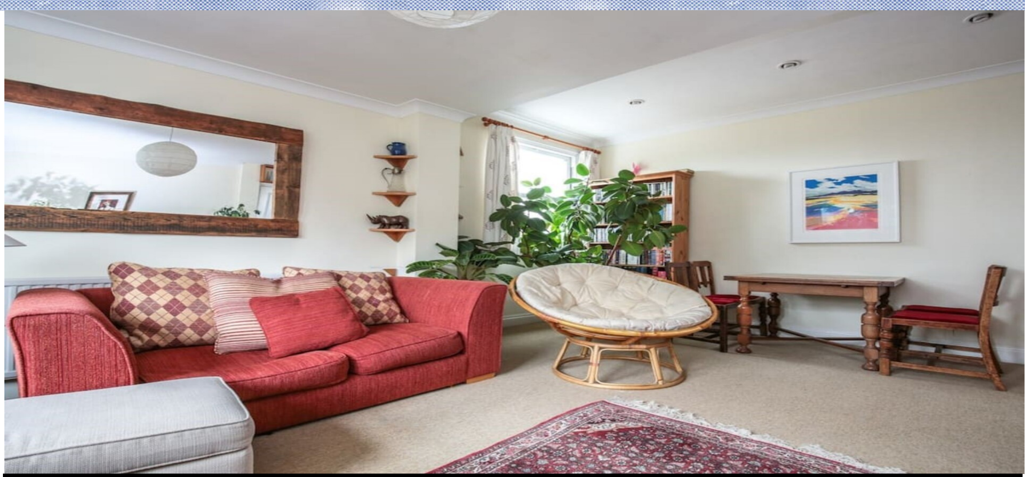
2 Bedroom Apartment To Rent In Crouch End £461pw (£2000 pcm)