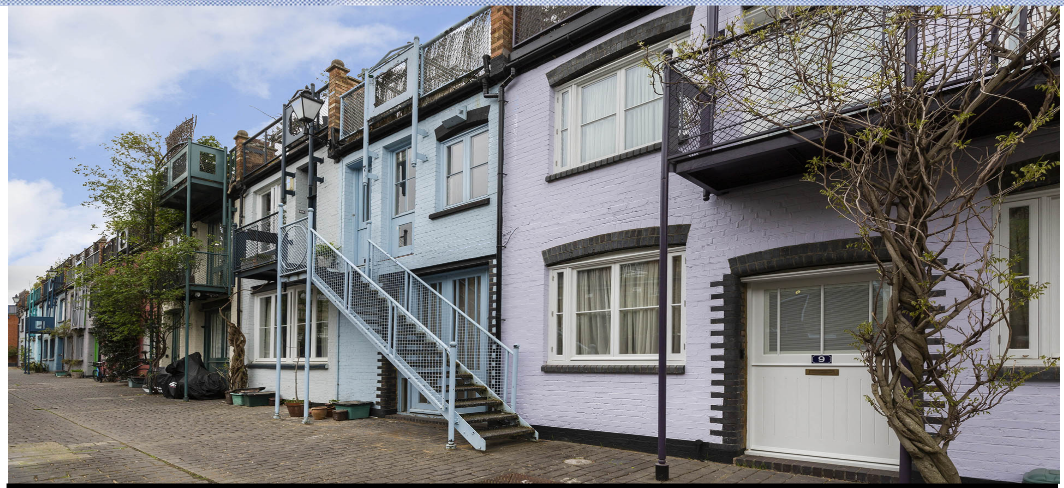
2 Bedroom Flat To Rent In Archway £750pw (£3250 pcm)