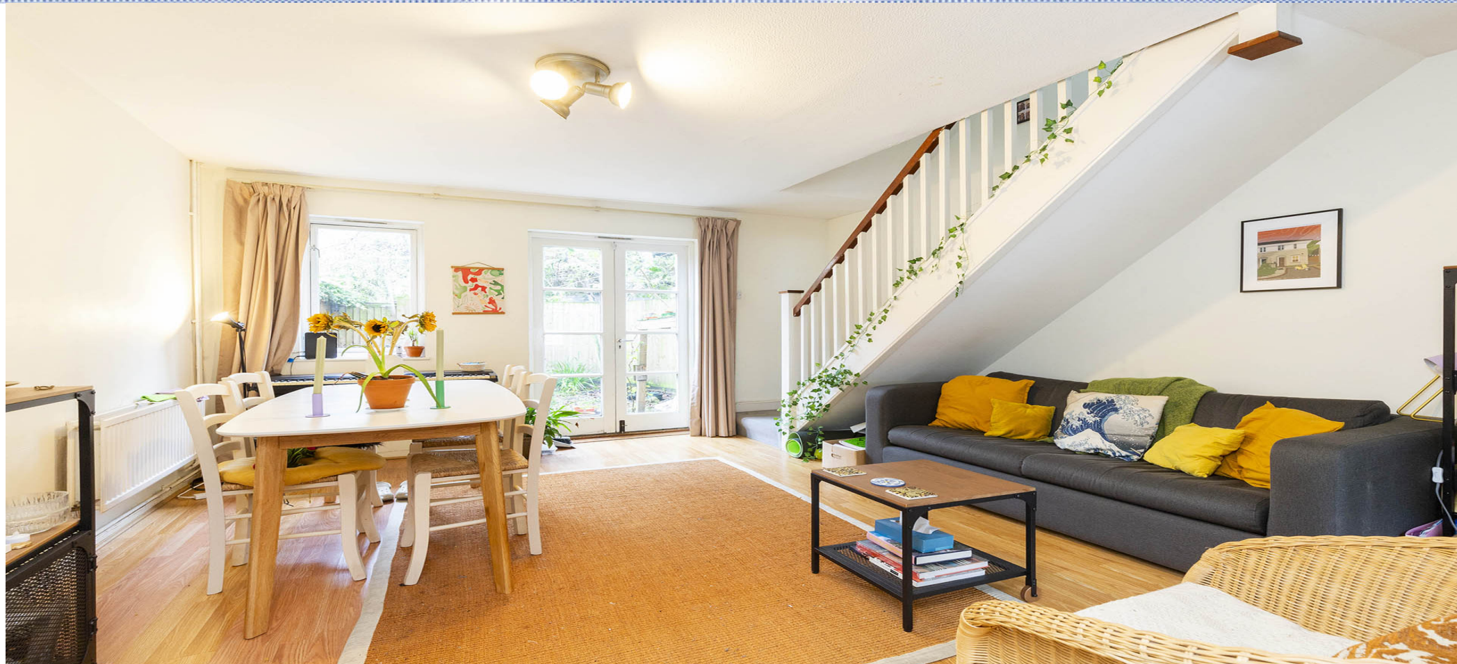
2 Bedroom Flat To Rent In Camden £595pw (£2578 pcm)