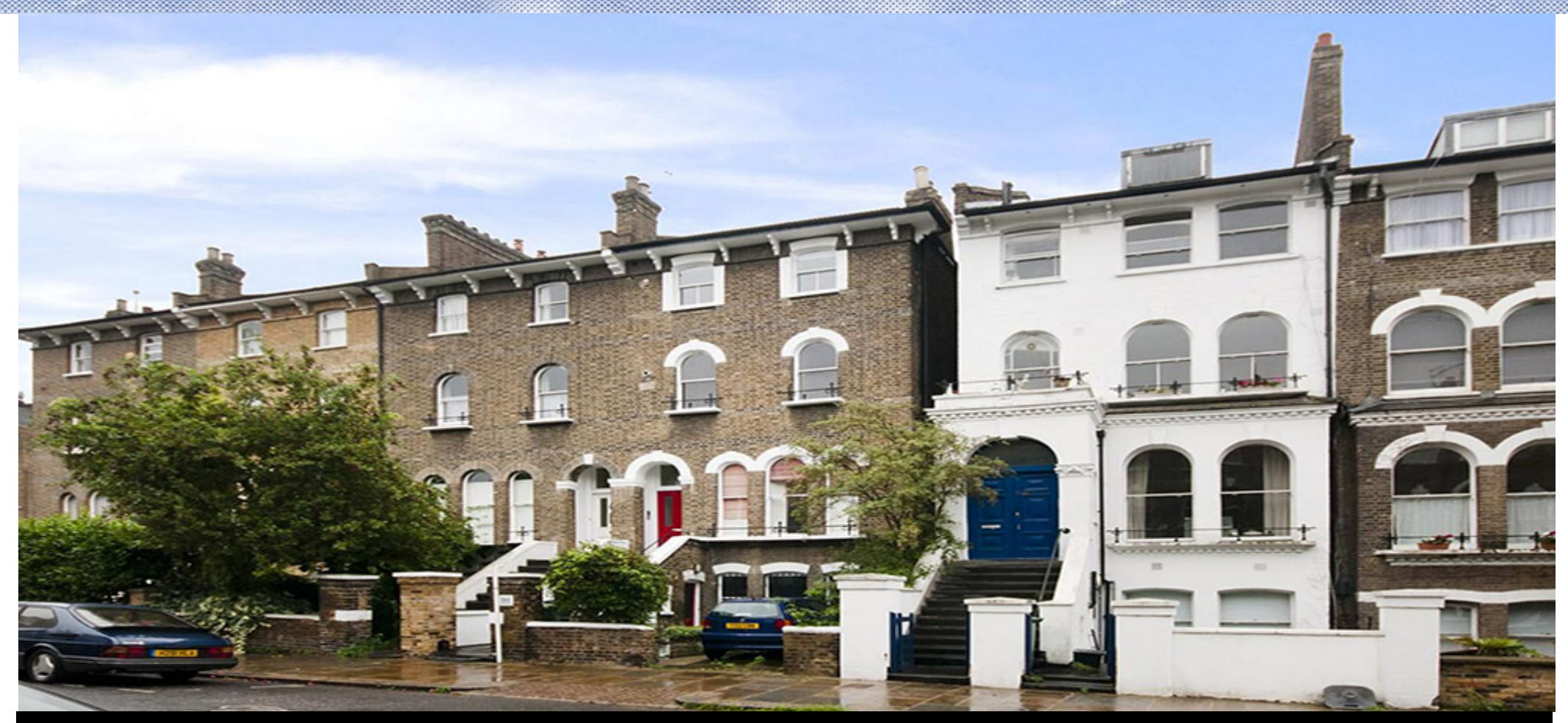
2 Bedroom Flat To Rent In Camden Square £500pw (£2166 pcm)