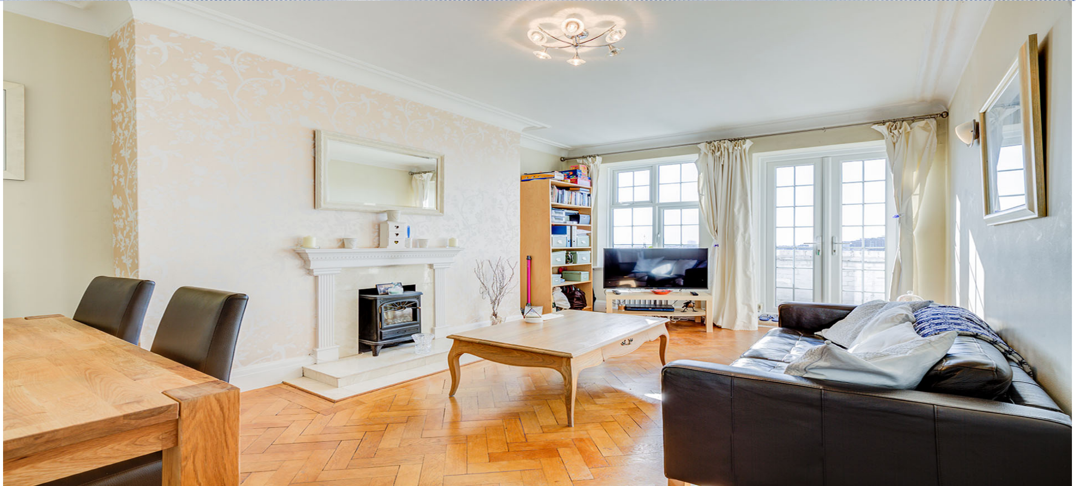
2 Bedroom Flat To Rent In Finchley Road - Swiss Cottage £450pw (£1950 pcm)