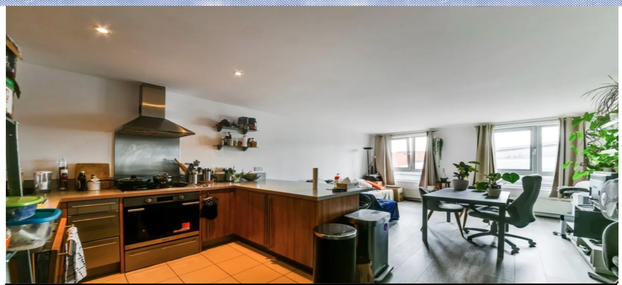
2 Bedroom Flat To Rent In Holloway £635pw (£2750 pcm)