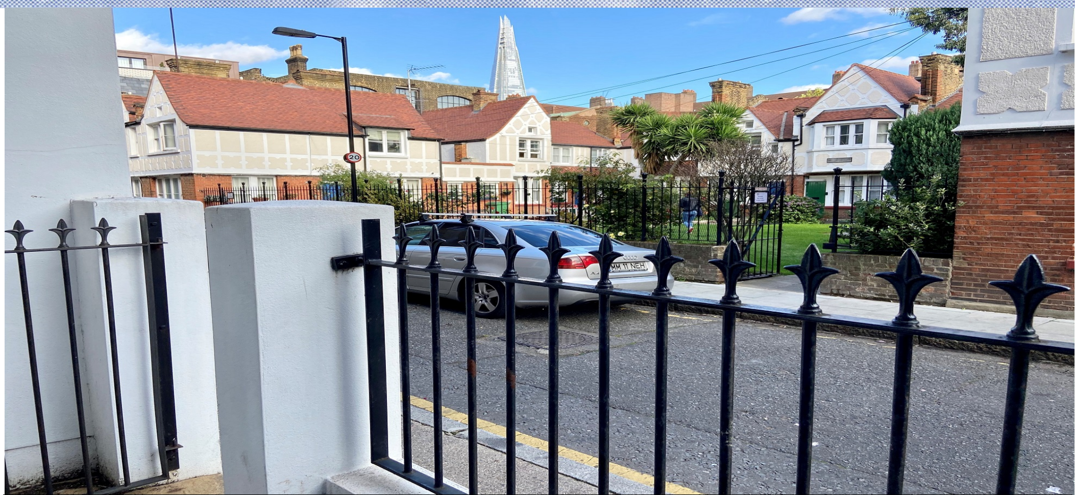
2 Bedroom Maisonette Rent In Borough/Southwark£ 515 p.w. (£2232 pcm)