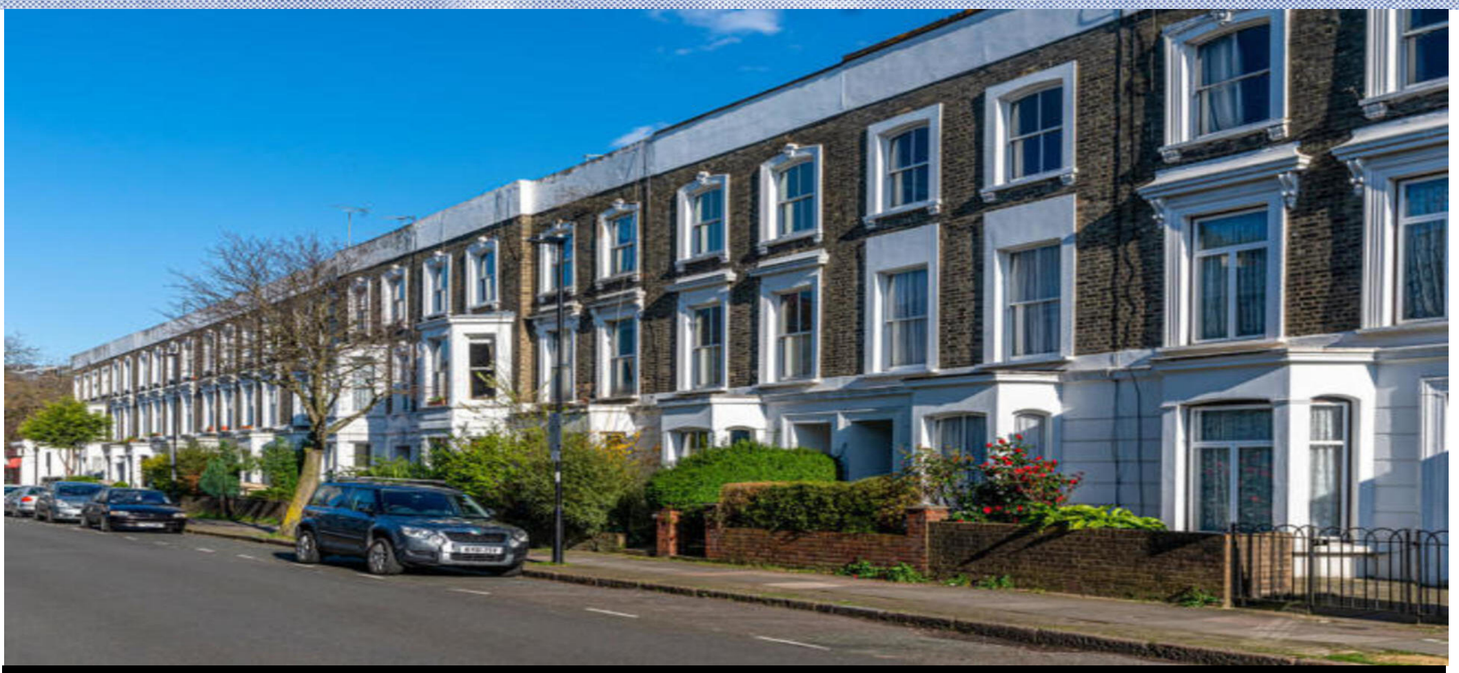
3 Bedroom Apartment Rent In Highbury / Holloway£ 550pw (£2383 pcm)