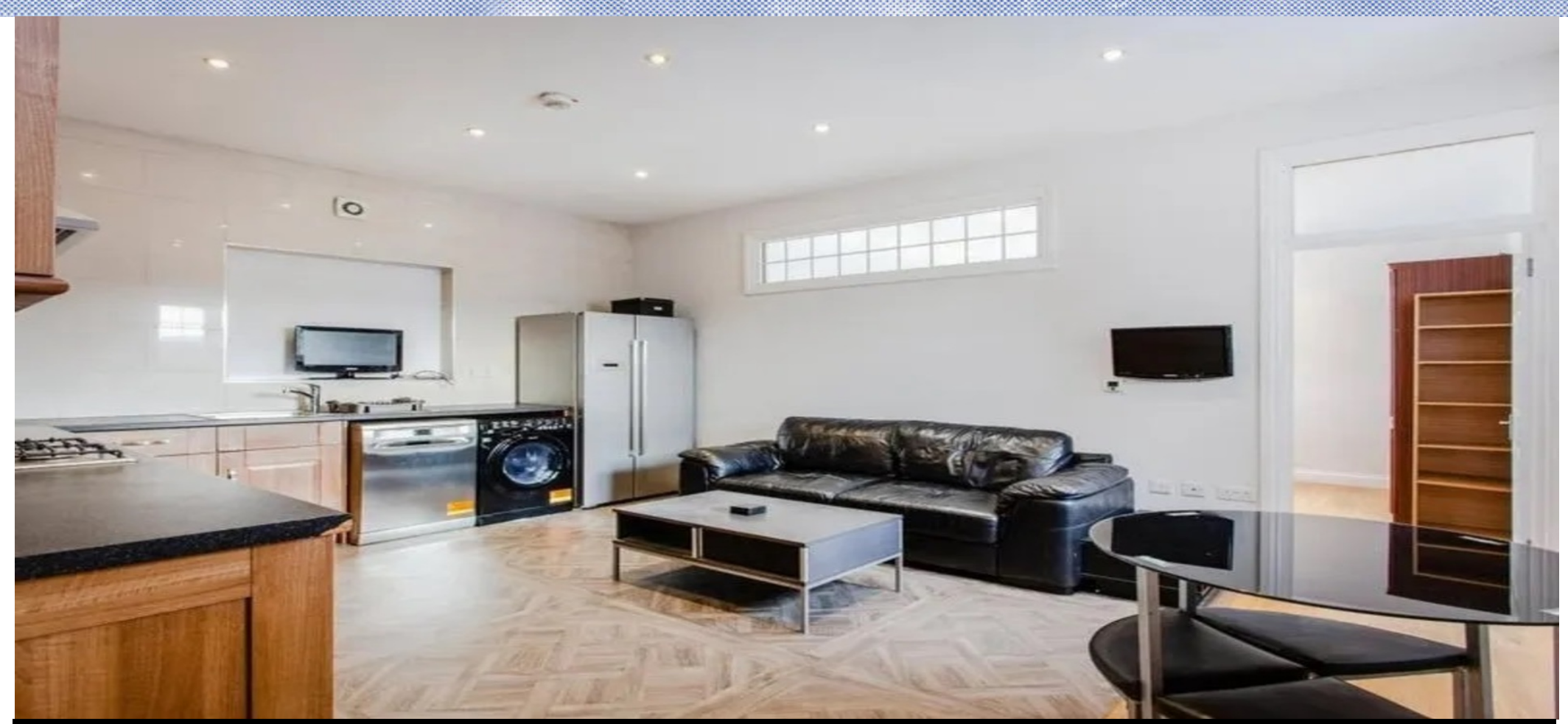
4 Bedroom Apartment Rent In HOLLOWAY £ 1142pw (£4948 pcm)