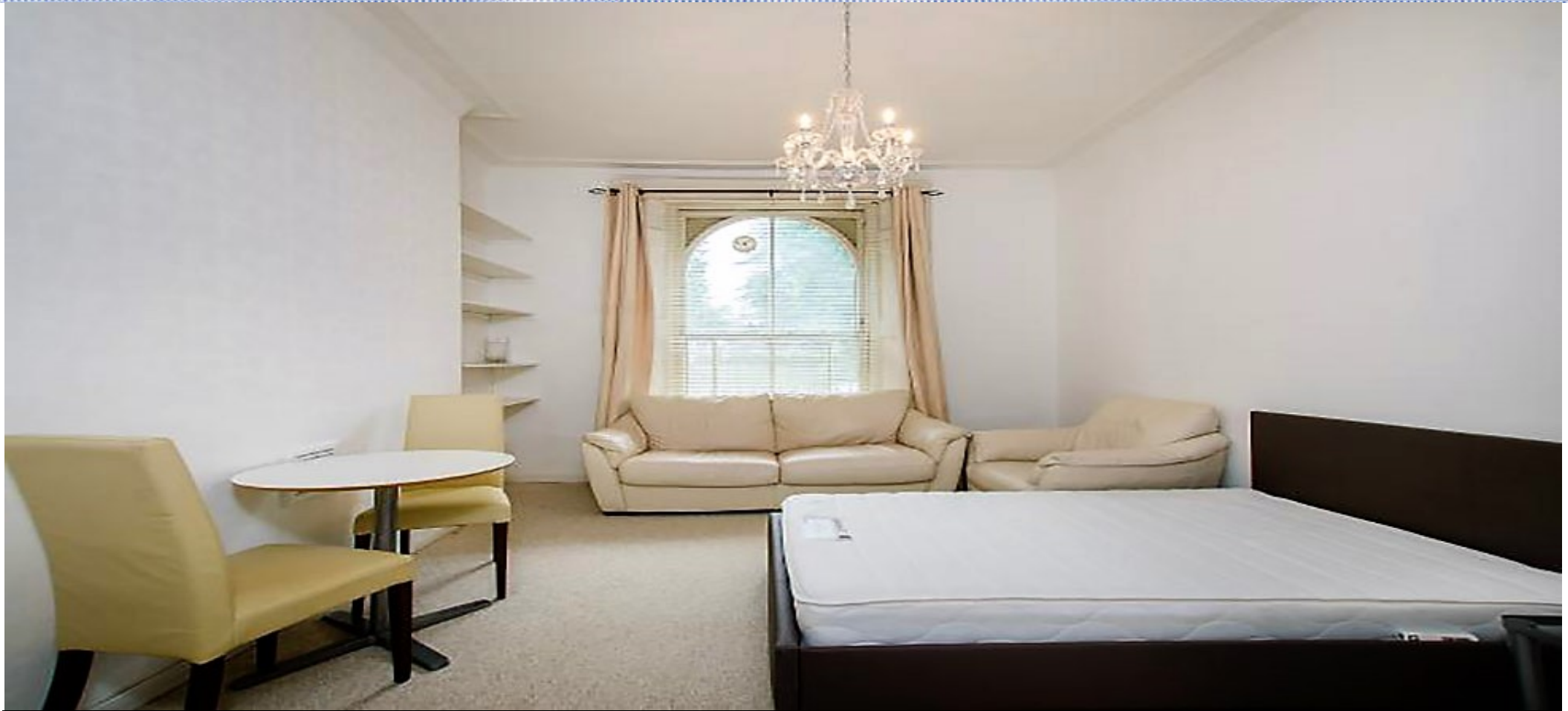
Studio Apartment Studio To Rent In Camden - Regents Park £420pw (£1820 pcm)