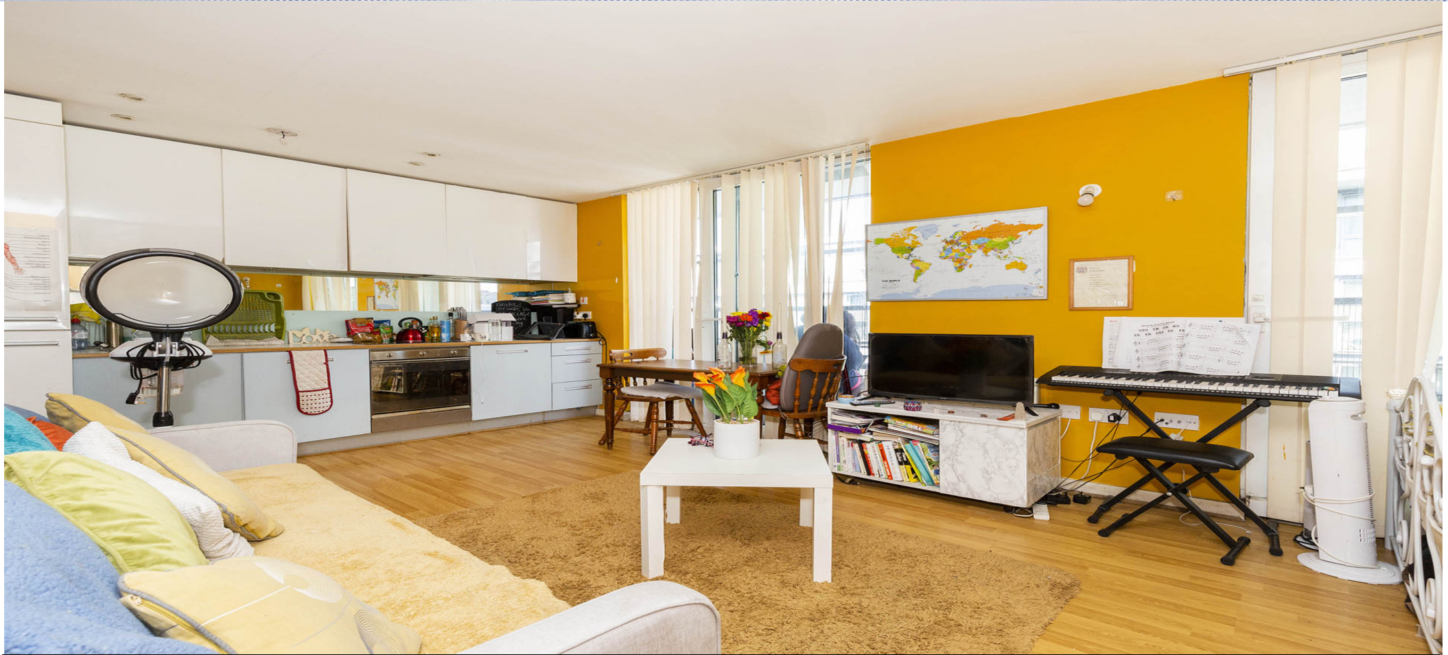
Studio Apartment To Rent In Crouch End / Hornsey £346pw (£1500 pcm)