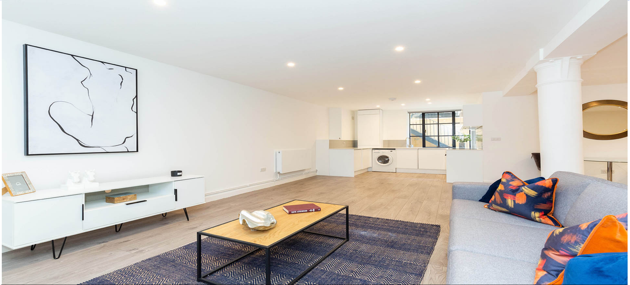
Studio Apartment To Rent In Dalston £429pw (£1860 pcm)